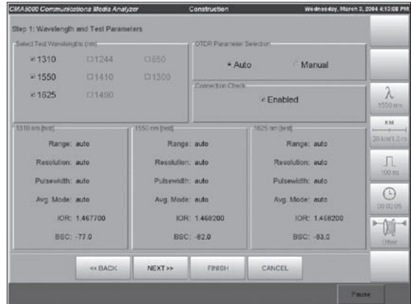
Construction OTDR – automated multi-fiber testing

Cable commissioning is also automated through the use of Construction OTDR mode where a wizard allows the user to select the required testing wavelengths, number of fibers and file naming scheme. The wizard then becomes the project manager guiding the user through the testing and ensuring consistency with testing parameters and file naming – virtually eliminating user induced errors.